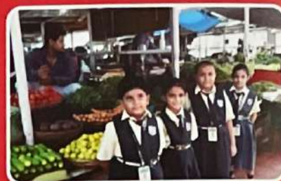
VEGETABLE MARKET (Std-4)