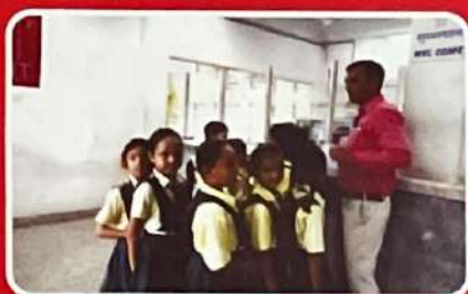
POST OFFICE (Std-3)