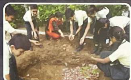
WORMI COMPOST PROJECT