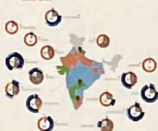
INDIA SOLAR MAP 2016