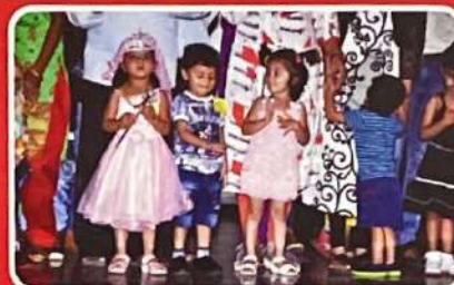
HEALTHY BABY CONTEST