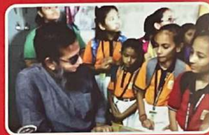
BLIND SCHOOL (Std-6)