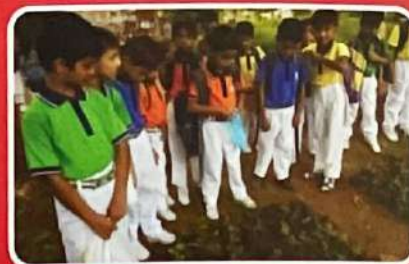
NURSERY FARM (Std-2)

Our main motto for this field trip is learning real-life applications that make them understand and appreciate the importance and relevance of things around them and development of analytical and observation skills by giving exposure to field trips.