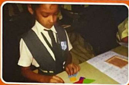
TANGRAM PUZZLE MAKING