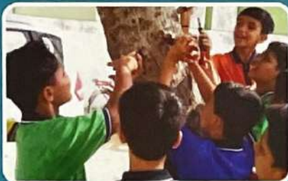
FREE THE TREE DRIVE