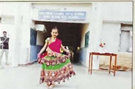
SOLO DANCE COMPETITION