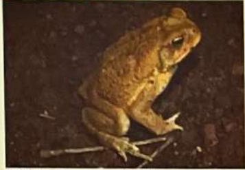
( Rhinella marina )

Native To: Northern South America, Central America and Mexico