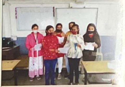
NEW YEAR CELEBRATION