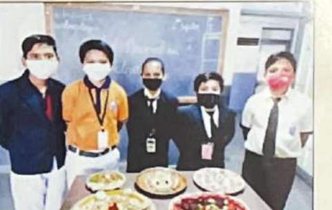
SALAD MAKING COMPETITION