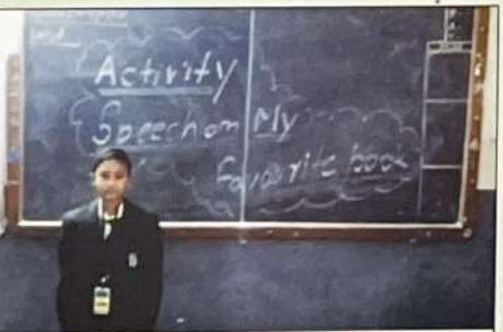
SPEECH ON MY FAVOURITE BOOK