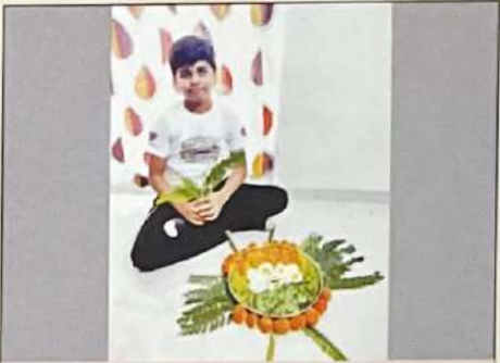
TRICOLOUR RANGOLI MAKING