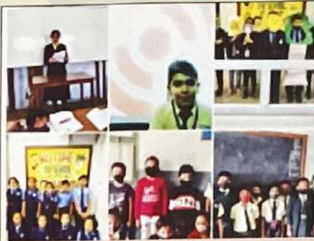
NEWS READING ACTIVITY