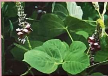
( Pueraria montana var. lobata )

Native To: Eastern Asia and some Pacific Islands