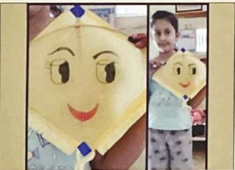
KITE MAKING ACTIVITY