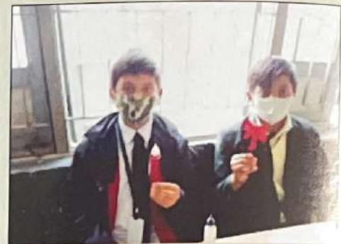
PAPER/WOOLLEN FLOWER MAKING ACTIVITY