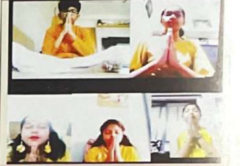
VASANT PANCHAMI & SARASWATI POOJA