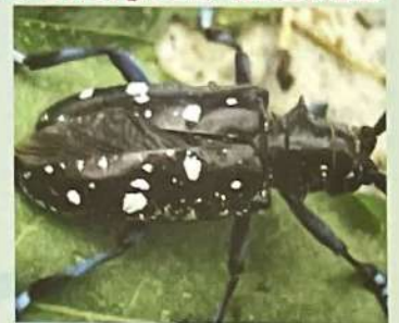
( Anoplophora glabripennis )