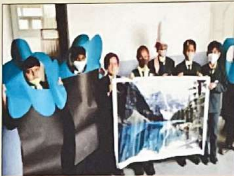
PAPER CROWN MAKING ACTIVITY