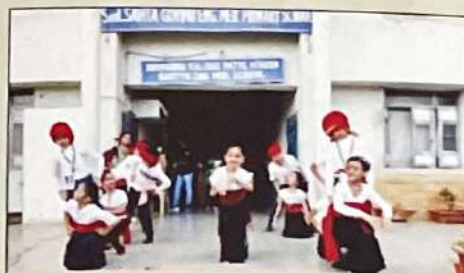
TRIBAL DANCE COMPETITION