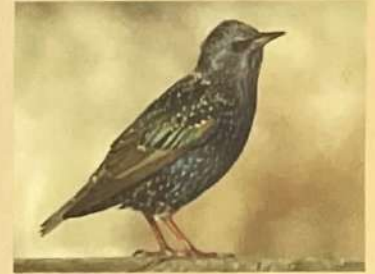
( Sturnus vulgaris )